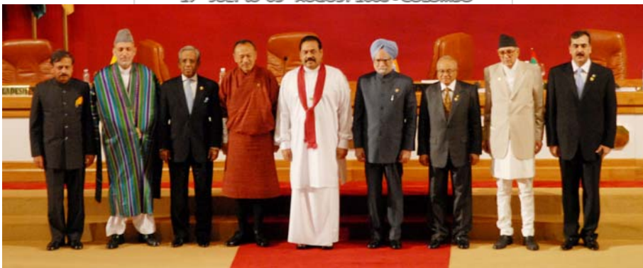
SAARC to forge ahead with meaningful programs under SL chairmanship

A productive and fruitful 15th 'Heads of State' SAARC summit was concluded at the BMICH in Colombo recently with high priority and strong focus laid on taking collective action to confront Food and Energy Hikes in the region as well as the scourge of terrorism. SAARC has also plans to initiate cooperation with other regional bodies such as EU and GCC.