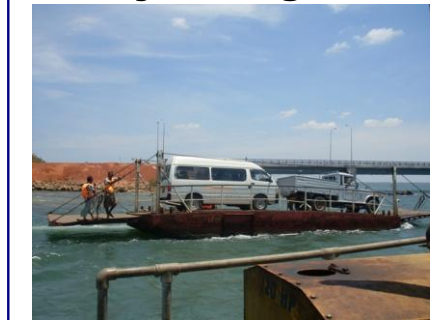
The Kinniya Ferry

Kinniya, has a 400 year old rich history. It has a population of more than 100,000 with 32 schools catering to the children's education within the area. It was well-known for pearl fishing and elephant hunting. The descendants of the Panicker family-caretakers of elephants- could still be seen in the village. It is also the single largest Muslim village in the island. Human occupation included fishing, trading and agriculture. Through traditions, the villagers are well-mannered, hospitable, religious, and greet people with their ancestral smile.