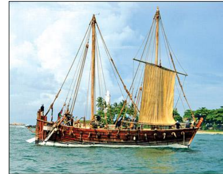
The 9th century sailing vessel Jewel of Muscat at the Galle Port

The Jewel of Muscat, a replica of a 9th century sailing vessel arrived at the Galle Port yesterday. Coinciding with this historic occasion a welcome ceremony was organized by the Foreign Ministry.